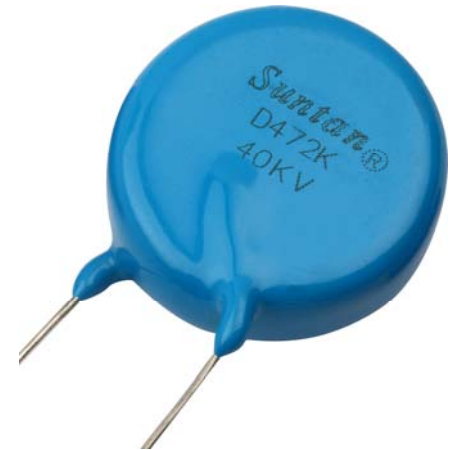
MINIATURE FINE SERIES